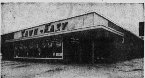
SAINT JOHN, N.B.