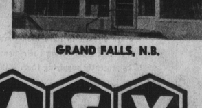
GRAND FALLS, N.B.