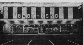
SAINT JOHN, N.B.