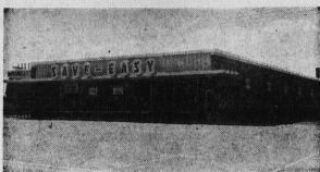
CHATHAM HEAD, N.B.