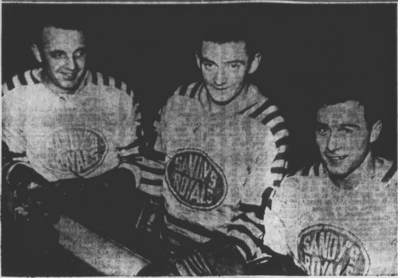
MEET HAWKS TONIGHT

SECOND PERIOD Play in the second period pretty well followed the pattern