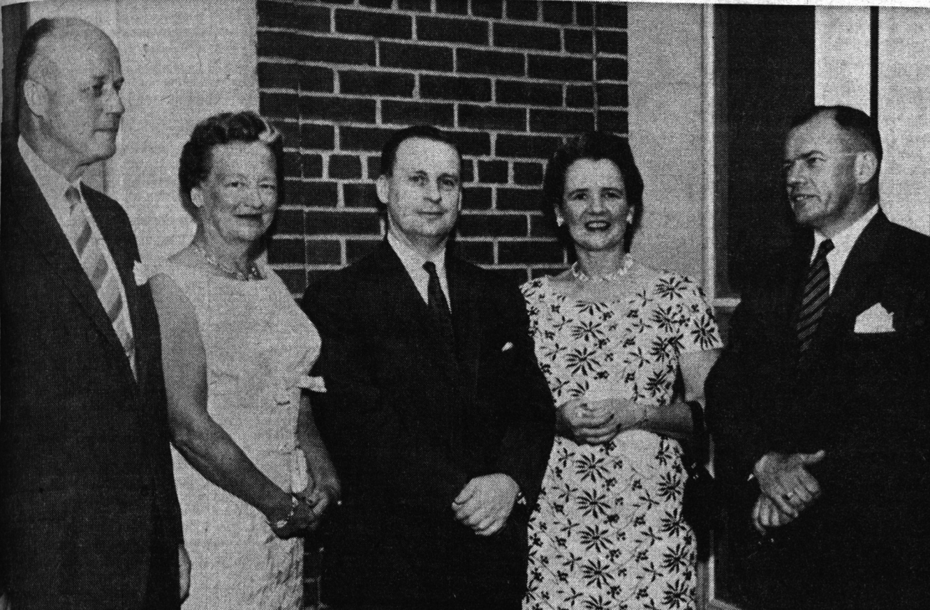
VISITING BANK OFFICIALS HONORED

12 PAGES Authorized as Second Class Mail by the Post Office Department, Ottawa