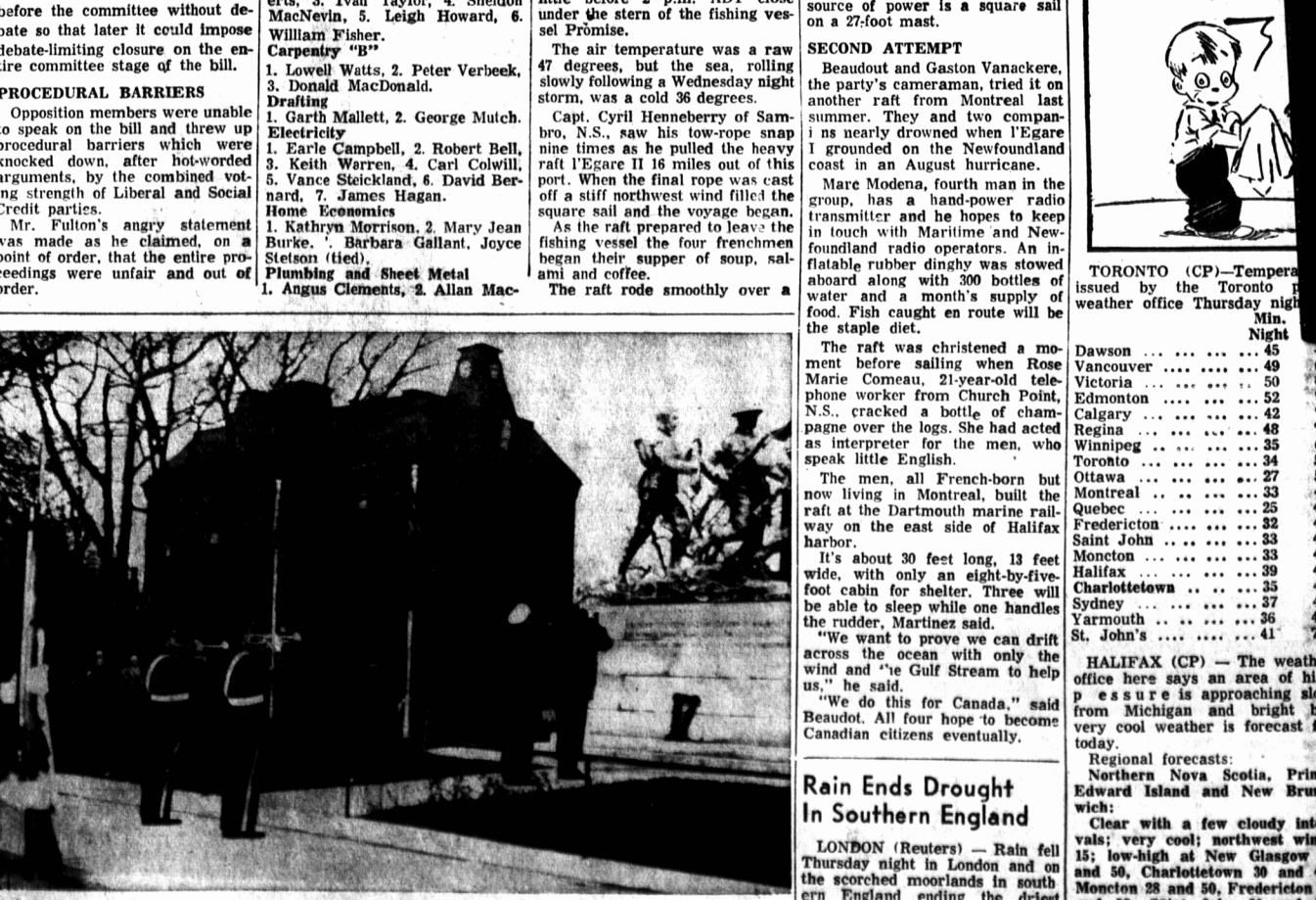
CEREMONY AT MONUMENT

LONDON (CP)—Air mail from northern England to Canada is to be speeded up this summer by direct flights from Manchester to Montreal.