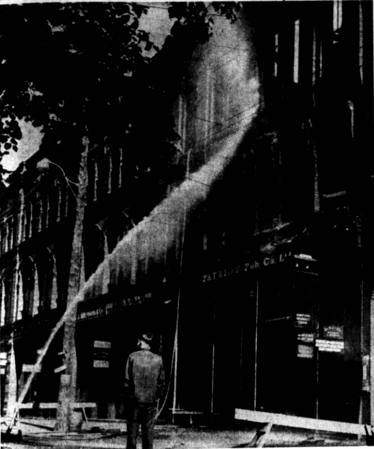
A Sunday morning shot of the Patriot Office building and the other offices above shows the extent of the damage. The windows are gaping and the daylight seen through the third floor windows indicates that the roof has fallen as a result of the fire that started just after midnight.

"Should India first ask the Queen to New Delhi or should she first invite India's president to visit London? "These are questions which must be settled before she can make this exciting trip."