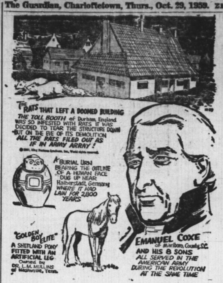
THE RATS THAT LEFT A DOOMED BUILDING THE TOLL BOOTH of Durham, England was so infested with rats it was decided to tear the structure down. ALL THE RATS' FEELING OUT AS IF IN AN ARMY!

11:03—Mr. Homme's House. 11:15—Kindergarten of the Air. 11:30—Conductor's Corner. 11:45—In Reply 12:00—Jamboree Junction. 12:30—Maritime Farm Broadcast. 1:00—News and Weather. 1:15—The Archers. 1:30—Kostelantz In Concert 2:00—Through The Years 2:15—Tommy Hunter Show. 2:45—Music in Black and White 3:00—News. 3:03—Trans-Canada Matinee. 4:00—Concert Hall 4:30—Drama In Sound. 5:00—News. 5:03—Maritime Fish Broadcast 5:30—Tempo. 6:00—News and Weather 6:15—Regional Commentary, Maritime Sportscast, and Musical Interlude. 6:30—Tempo. 7:00—News. 7:10—Commentary. 7:15—Music. 7:30—Rawhide and Music. 8:00—Teen-Tempo and Music. 8:25—Tempo 8:30—Album for Thursday 9:00—Contact 9:45—Footloose. 10:00—Contact 11:00—News Roundup and Talk. 11:30—Eventide. 12:00—Here's the Weather and Sign Off.