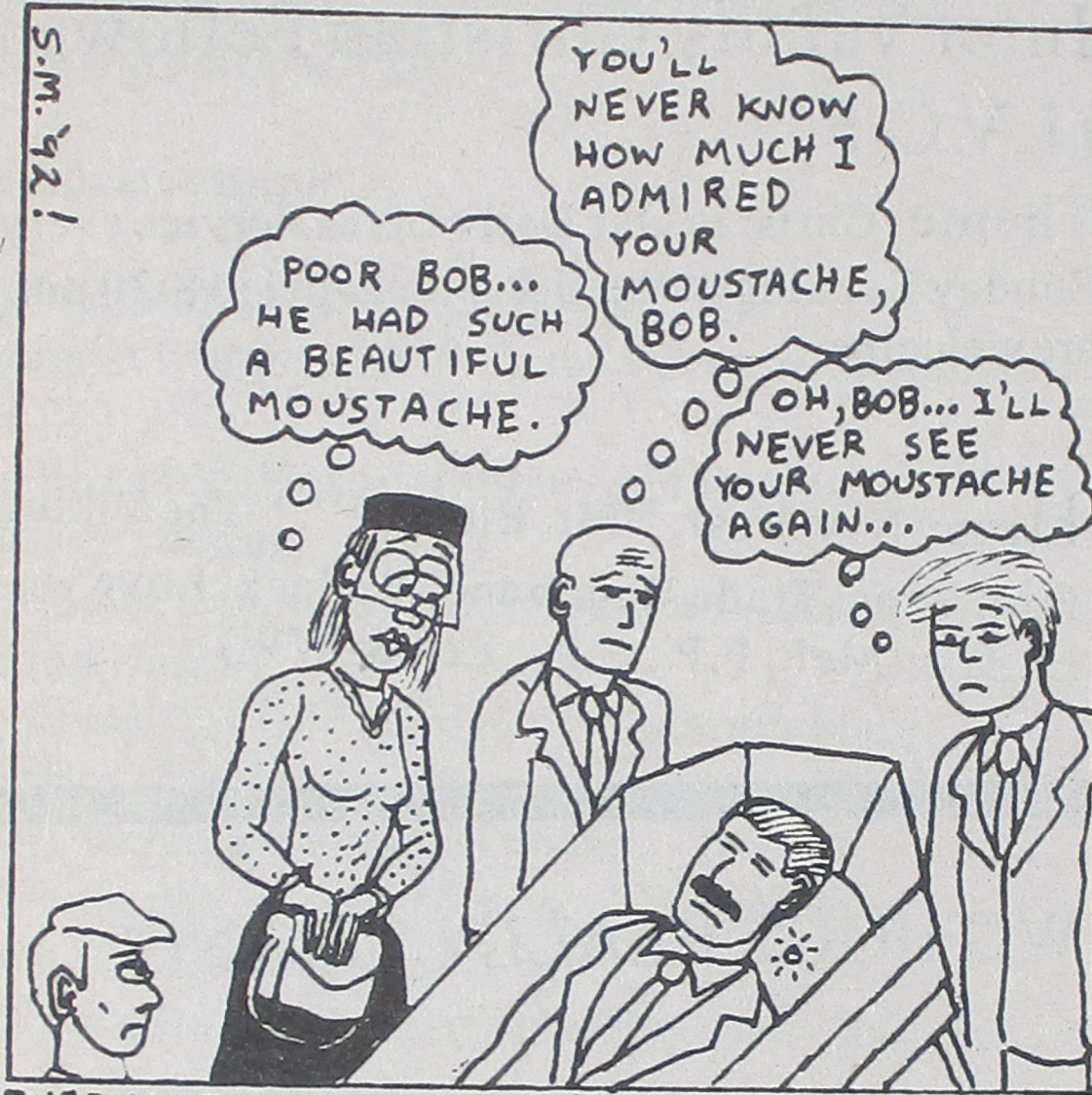
EVERYONE ADMIRES A "STIFF UPPER LIP."