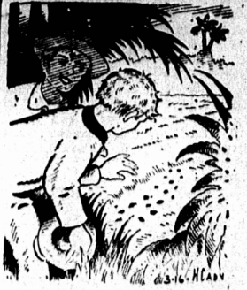
"If that isn't a possum's footprint then I've never seen one."

Sure enough, a small Crab scuttled along sideways but fast and disappeared in one of the holes. The two boys kept still for a few minutes. Presently a little Crab, a