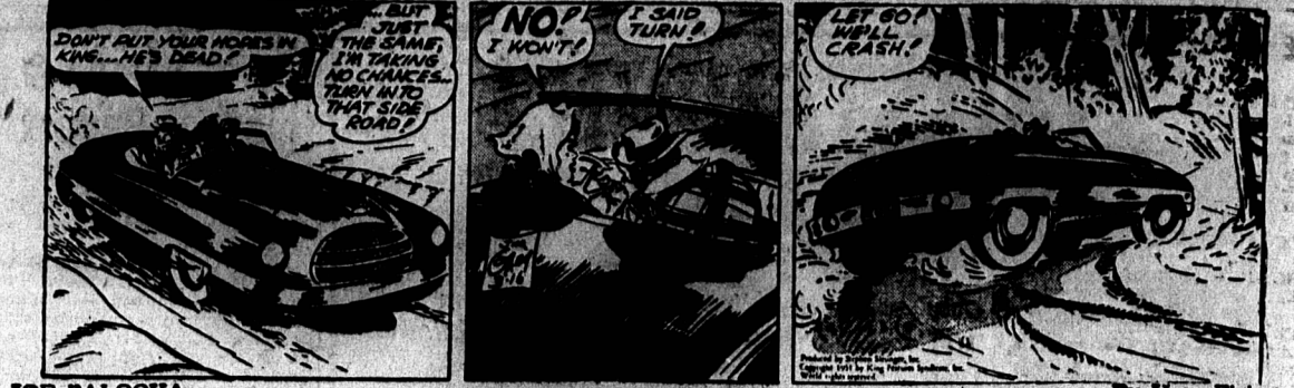
By Ham Fisher