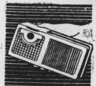
Transistor Radio makes a wonderful gift. We have all the best makes from $32.88 up.