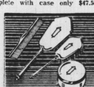
Dresser Sets — a useful and wanted gift — in chrome or sterling from $14.95 up.