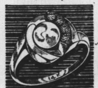
Stunning rings with precious stones from the far corners of the globe. We have just the one for her.