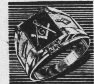
Massive Gents Onyx Rings with lodge emblem or initial from $9.98 up.

There's hardly a child that wouldn't be pleased with a gift of a pet for Christmas. The parents are the ones to think about. Pets are seldom completely cared for by the child—the parents will therefore have to take on extra work. Also it must be taken into consideration that the feeding and care of pets costs money. If you are thinking of a puppy as a gift—also look into the matter of sufficient outdoor space for the animal to romp in. One of the most popular pets right now is the parakeet. It is relatively easy to care for, it's feed is inexpensive, and these birds need only cage area. And, because they talk, it's very easy to become lovingly attached to parakeets. Tropical fish are another idea as an inexpensive, easily cared for pet. You have a wide price range selection too as you can choose one fish and a bowl or a large aquarium full of fish. It might be a good idea to query the parents before giving a child a pet for Christmas. If they say "yes," you can be sure, however, that your gift is going to be the most treasured one received.