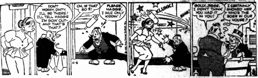
BRINGING UP FATHER

Helps keep Mouth Fresh-Breath Sweet Get some today.