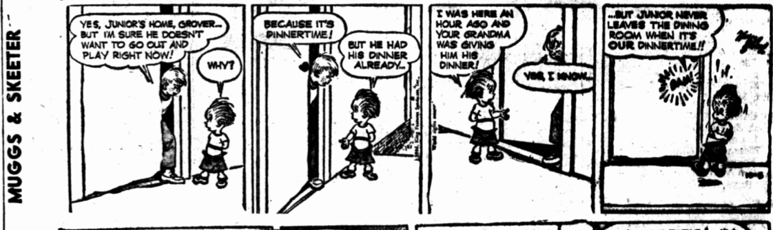
MUGGS & SKEETER