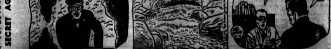
SECRET AGENT X9