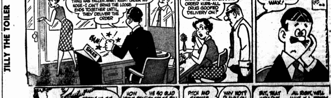
TILLY THE TOILER