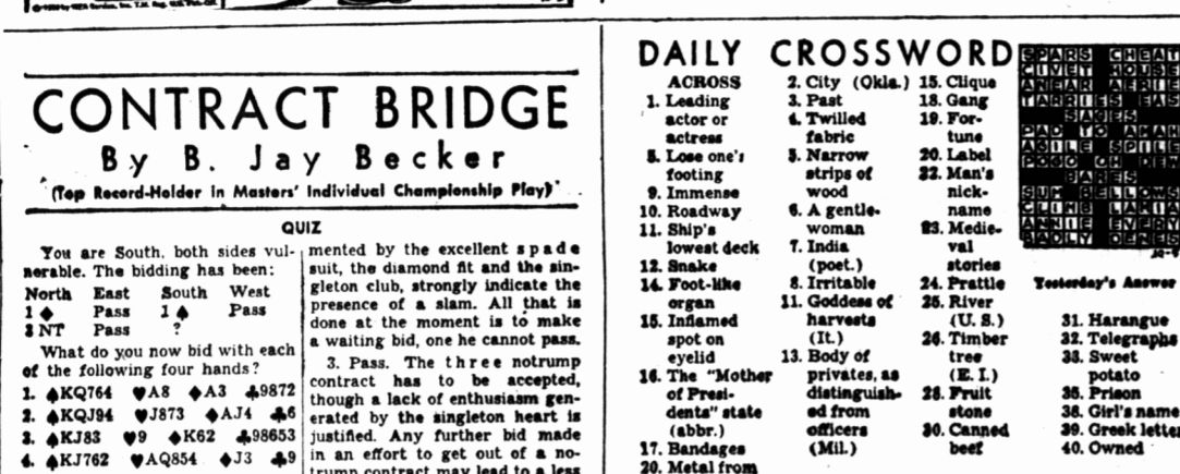
CONTRACT BRIDGE By B. Jay Becker (Top Record-Holder in Masters' Individual Championship Play)