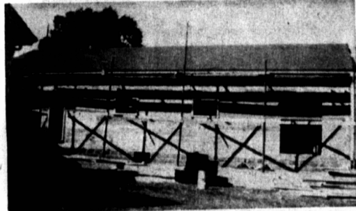
BUILD CHURCH HALL