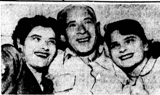
EX-REED M.P. RELEASED FROM PRISON