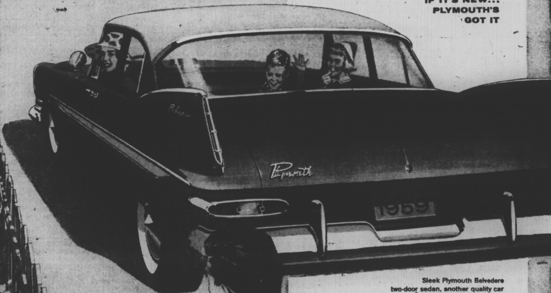
Sleek Plymouth Belvedere two-door sedan, another quality car of Chrysler of Canada.

Nothing takes bumps like a Plymouth takes bumps, with improved Torsion-AIRE Ride to flatten out the roughest, toughest roads.