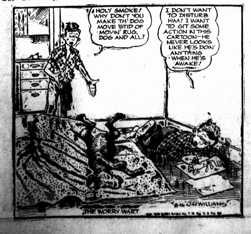
THE WORRY WART