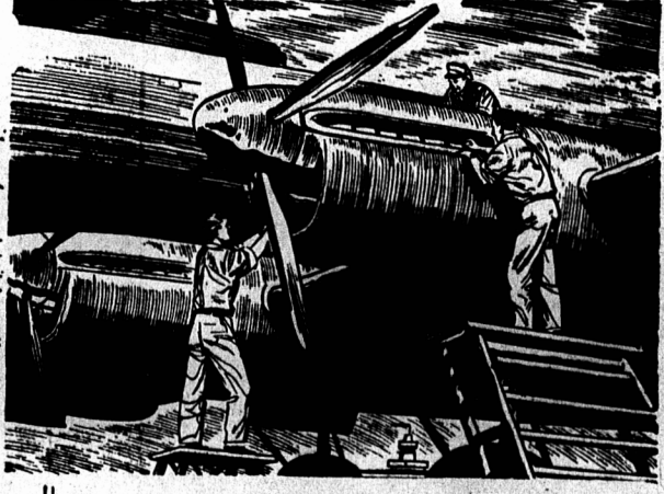
Aeroplane parts must have dependable strength and minimum weight. That's why Nickel alloys are used. In the engine, landing gear and all through the ship Nickel alloys are found. And in the galley, the hostess prepares the food on surfaces made of bright, sanitary Nickel alloys.