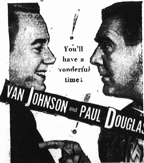
He befriends a crook and finds fun and adventure! The crook who says and does the most amazing thing in!

A young priest befriends the man who shares his state-room on a boat bound for Rome. On the morning the ship docks, the priest wakes to find his clothes and identification gone! His friend is a fugitive from justice and has chosen this way to escape. The adventures of the priest in search of the crook and their eventual reunion makes for one of the finest, funniest and most heart-warming pictures of the season!