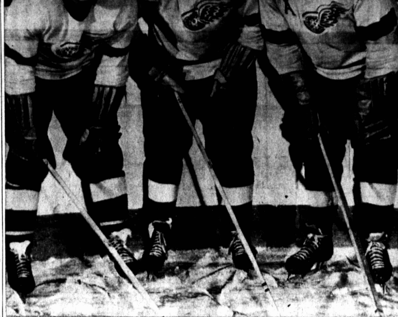
DETROIT'S PRODUCTION LINE