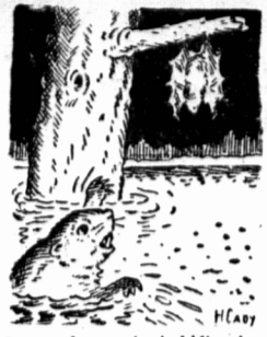
"Do you know who is hiding in a hole high up in that tree?" asked Paddy.

Thousands of couples are weak, worn-out, exhausted because body lacks iron. For a new younger feeling after 40, try Ostrex Tonic Tablets.