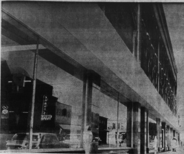
SUMMERSIDE STORE CAPTURES 'NEW LOOK' IN FINE NEW DISPLAY WINDOWS, FRONT