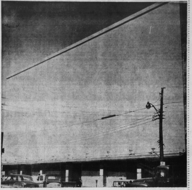
MASSIVE NEW STORE FRONT IS KEIED TO MOOD OF MODERNITY AT CHARLOTTETOWN STORE

SUMMERSIDE STORE The Summerside store is an old building with no front improvements made since 1944. It received much the same treatment as the Charlottetown store except that the enamelled steel panels do not go to the top of the building. Most of the work was done around the entrances