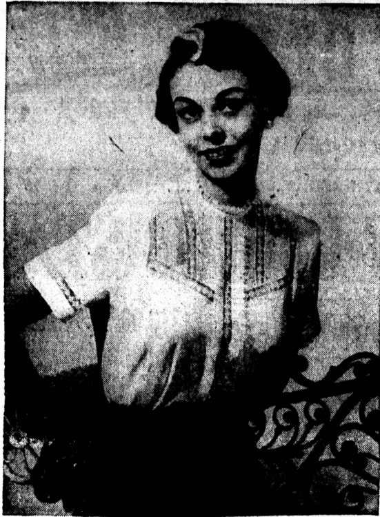
Lace insertion with embroidered organdy form a yoke on this delicate blouse from Maison France. A stand-up frill of lace frames the face.