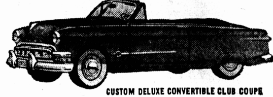
CUSTOM DELUXE CONVERTIBLE CLUB COUPE