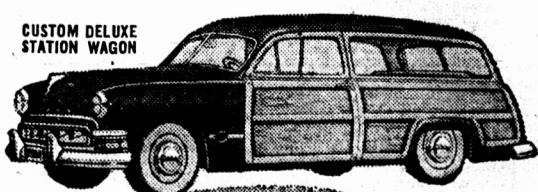
CUSTOM DELUXE STATION WAGON