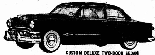
CUSTOM DELUXE TWO-DOOR SEDAN