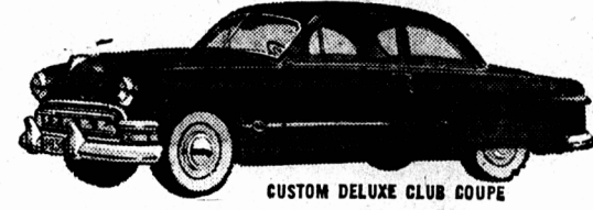
CUSTOM DELUXE CLUB COUPE