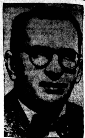
NEW FRENCH PREMIER FOR HOW LONG?

WITH THE CANADIANS IN KOREA, Feb. 1—(CP)—Every Canadian soldier in Korea has received a copy of the Canadian Army's new handbook on Korea, on a confidence vote.