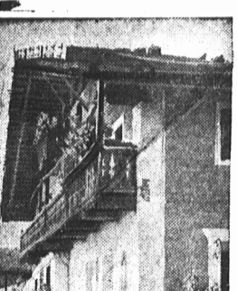
A Typical Farm house in the South Tyrol.

to them. The dream has come true as a nightmare to these home-loving people who, up to the time they were presented to Italy by the post-World War "peace arbiters" lived in peace and industry under their model, efficient communal form of autonomous government. One by one the natives throughout South Tyrol have seen their own religious mottoes effaced from their gayly frescoed houses. The sayings of Christ and of Prophet gave way to the mottoes of Mussolini: "My country is this: To make the Italian people strong, great, prosperous, free." "One faith, love of country; one desire, to make the Italian people great." Etc.