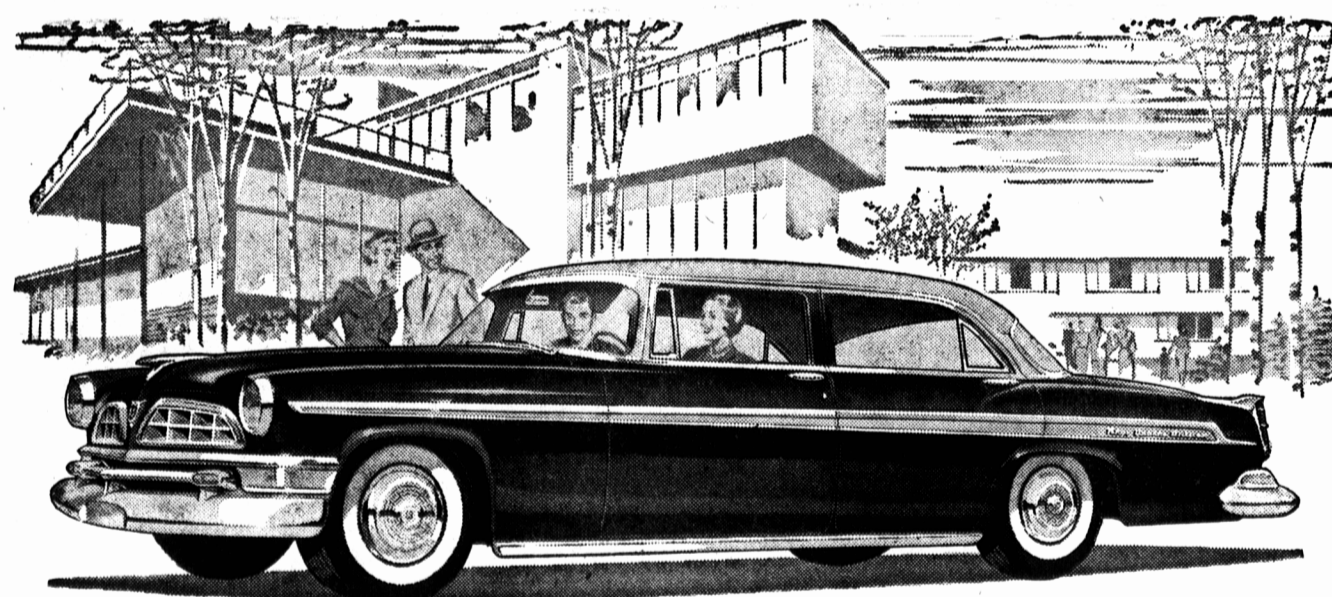
Chrysler New Yorker DeLuxe Four-Door Sedan

Every gleaming inch of this glamour car says, "There's distinctive design expressed in perfect taste." Its sculptured metal sparkles with highlights that express the clean, simple beauty of Chrysler's motion-design for "The Forward Look." Turn the key, and the mighty Chrysler V-8 engine comes to life. Let it whisper gently, then touch your