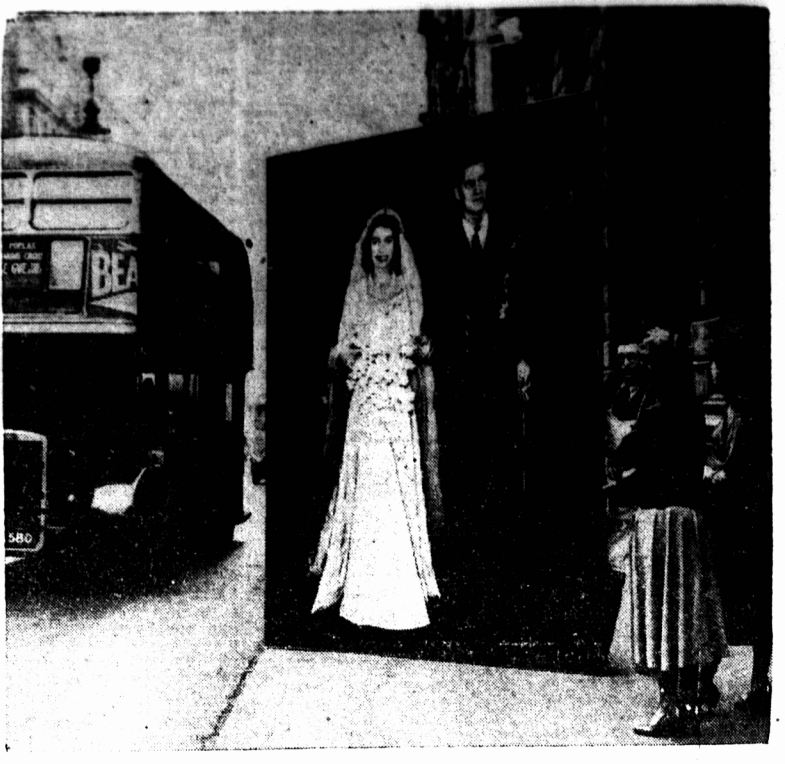
Dreamy pedestrians had to be alert to avoid collision with this enormous photographic enlargement of the Queen's wedding which blocked the entire sidewalk of London's famed Fleet St. The huge photograph was being shipped to Liverpool where it will form part of the many coronation displays.