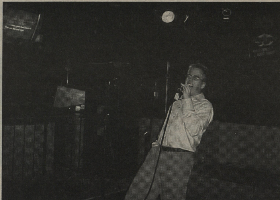
Cinephile's karaoke version of "Roxanne" was almost as good as Puffy's.

Breakers seems to be full of middle aged men and twenty-something girls. But on this particular night it hosts a wide range of characters. There are steroid-pumped/testicle-shrunken muscle men in gym shirts, guys who have their own pool cues which they carry in a case, a bald guy