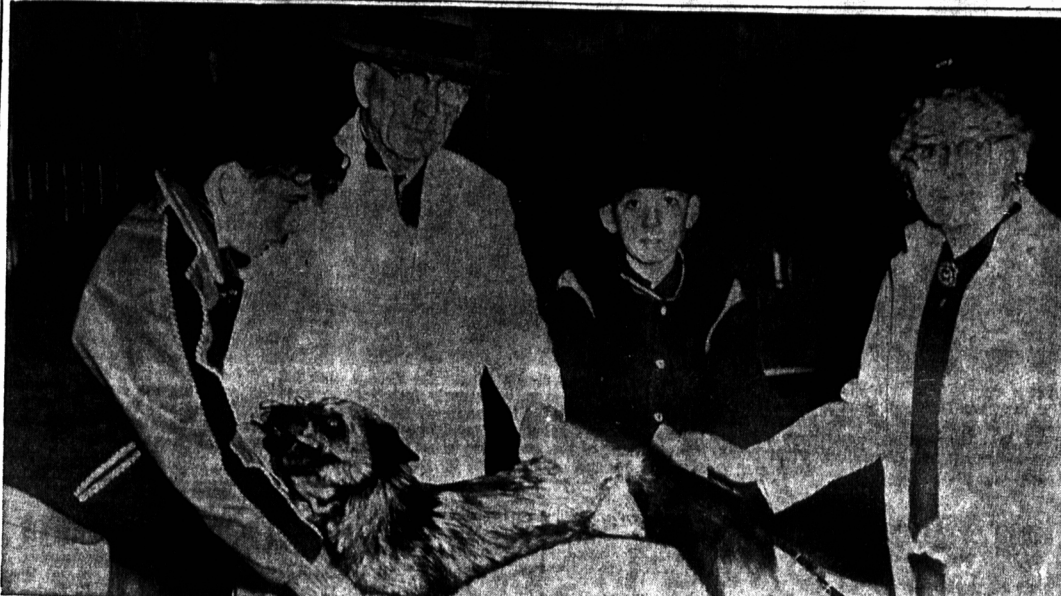
FOX JUDGING BEGINS TODAY