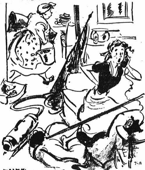
"I have my cleaning woman only two days a week, I need the other days to rest up."