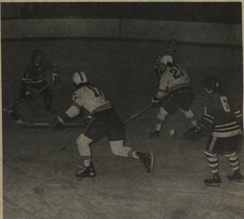
The Panthers play Memorial in early season action