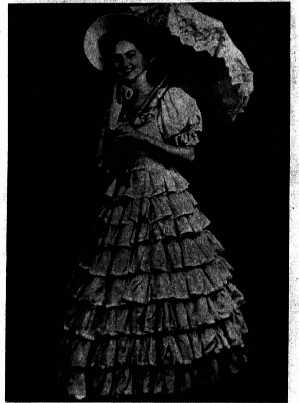
VISIT MISS 1857 IN HOLMAN'S YOUTH CENTRE SUMMERSIDE OR HOLMAN'S FURNITURE CHARLOTTETOWN AND FILL IN YOUR NAME AND ADDRESS ON THE FREE BALLOT SHE WILL GIVE YOU....You May Win One or More of the Valuable Prizes!

$2,110.00 In Birthday Presents FOR YOU NO PURCHASE NECESSARY $1,055.00 In Birthday Presents At Each HOLMAN Store