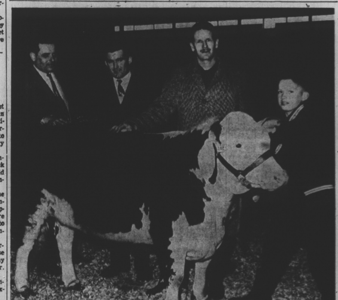
AN EXPENSIVE ANIMAL