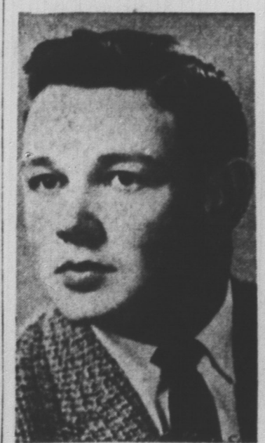
MT.. A. GRAD