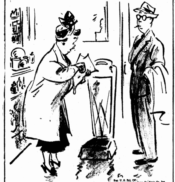
"I want to take one of these reducing pills before I step on the scales."