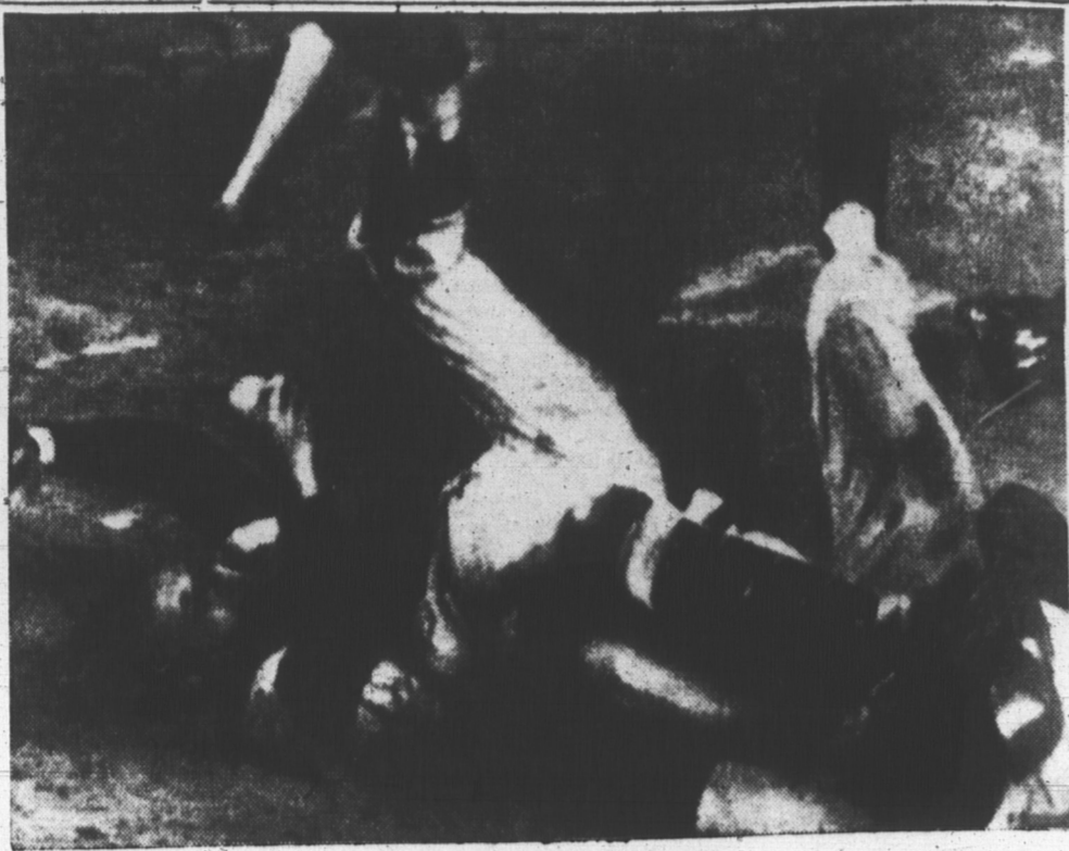
TANGLE AT HOME

SUMMERSIDE — Due to the wet weather the opening race card at Summerside Raceway was cancelled. The same program will be held tonight with post time at 8 o'clock.