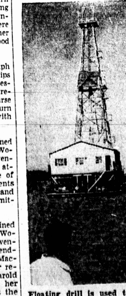
Floating drill is used to explore beneath Louisiana marshes for sulphur.

tion - plus the $35,000 bonus the government offers for good uranium strikes. Altogether, the Defense Minerals Exploration Administration has earmarked $10,000,000 to encourage exploration for 56 strategic minerals. It will pay from 50 to 80 per cent of the cost of finding these 56, which range from antimony to zirconium. But it doesn't shell out the money unless the prospector has a definite project in mind. The way to get government financing is to write to the Defense Minerals Exploration Administration in Washington. They'll send an investigator to study the project. . . . Corporations are doing a large share of the prospecting, because they can stand the huge costs of exploration even without government assistance. Many mineral industry firms have long maintained their own programs of this sort. Sulphur is a critically short non-metallic mineral. Is one example. New deposits of sulphur in its most economical and purest form the salt-dome brimstone of the Gulf Coast, are becoming increasingly hard to find. The Freeport Sulphur Company spent years and millions of dollars in the search, and finally uncovered a new deposit at Garden Island Bay, near the mouth of the Mississippi River in Louisiana. Its location in the marshy delta country makes plant construction and operation costly, but the strike is evidence that constant exploration brings results.