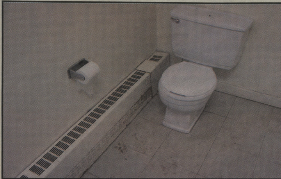
The Men's Bathroom in Dalton...would *you* like to spend time here?

This week's washroom in question is found on the main floor of Dalton Hall. First of all, has anyone else noticed that Dalton is probably the worst smelling building on campus? Just had to throw that out there. In any case, this washroom doesn't help. It's kind of a dump— which is I suppose fitting for the activities performed there. But still. Even I prefer a clean facility, which this most definitely is not. The open bag of garbage off to the side didn't help, and the wet mud tracked over the floor wasn't very nice either. I know, it's that time of year, but this wash-