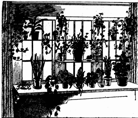
A Winter Window Garden Makes Spring Come Faster, and... Teaches Many Lessons

A wider variety of plants, Cyclamens bloom freely in this location, and Paper White narcissi do much better than in a sunnier window, where the temperature range is much greater. Begonias, which may be injured by too much sun do well. It is an ideal spot for African violets, Amaryllis, calla lilies, and all the hardy bulbs will thrive, and of course the foliage plants and florists' green plants.