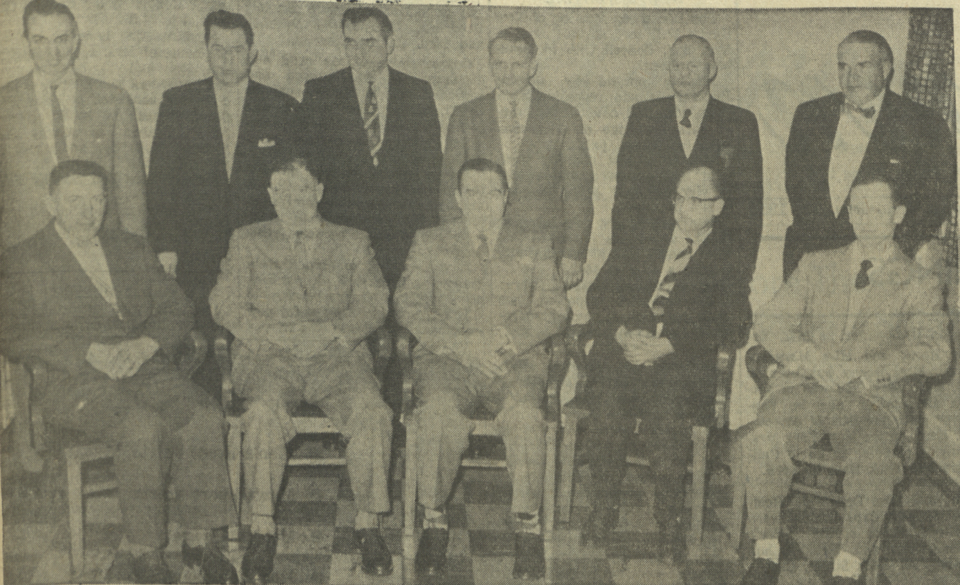
THE NEW OFFICERS and attending doctors at the annual meeting of the P.E.I. Veterinary Association held at the Health Centre last evening.