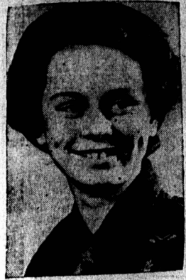
B. C. GIRL GUIDE RECEIVES MEDAL FOR BRAVE DEED