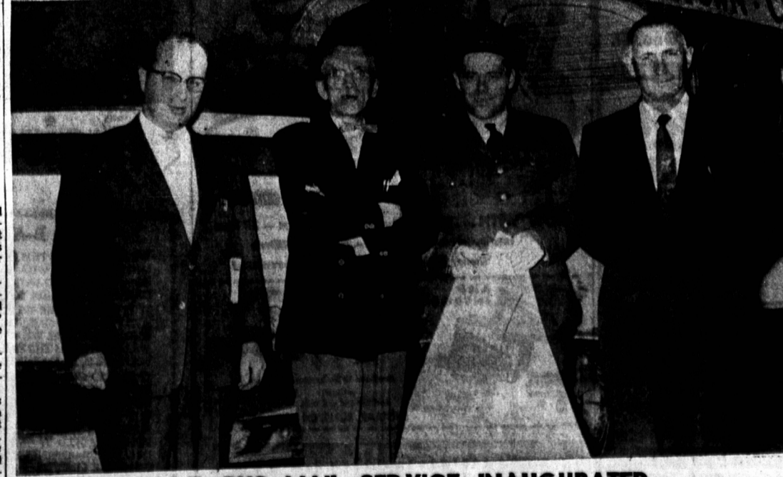
I. M. T. BUS MAIL SERVICE INAUGURATED

Then in mid-afternoon he changed his mind. He said he had asked his Washington office to issue a statement in his name. The statement, apparently designed to calm a nervous and frightened market, said Mr. Eisenhower's illness was a cause of sadness but not of alarm.