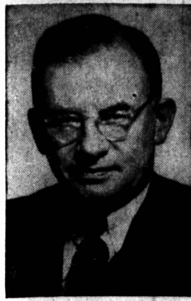
HON. BROOKE CLAXTON