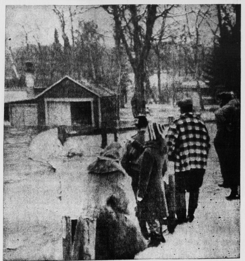
EVACUEES WATCH FLOOD Residents of Ste. Bridgette de Laval, 25 miles northwest of Quebec City watch swirling floodwaters from the Montmorency River wash through their homes. About 300 people were evacuated when an ice jam caused water to rise. (AP Wirephoto)

manded in custody to April 23 on a charge of theft of arms from the Shawinigan Armory. Most of the loot from the Shawinigan Armory robbery has been recovered. SEARCH FOR MONSTER ST. ALBANS, England (CP) Eight students from the Essex Institute of Agriculture are going to Loch Ness in a bid to establish conclusively whether a monster exists in the lake. They will use echo-sounding equipment developed from research into the hearing characteristics of amphibious animals.