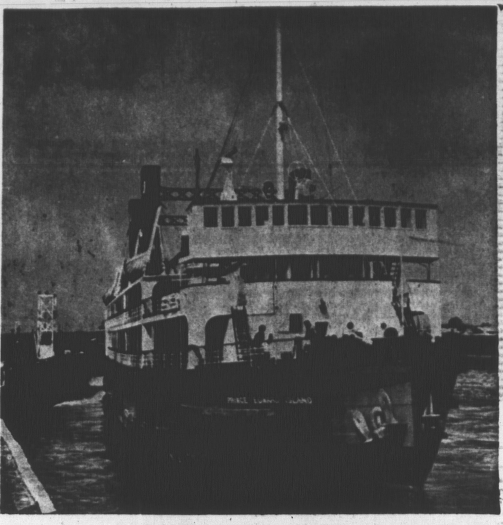
S.S. PRINCE EDWARD ISLAND

BORDEN — The Canadian National ferry Prince Edward Island, the first ship to give the Island province a continuous and reliable year-round link with the mainland across the Northumberland Strait, this week celebrates her 50th anniversary in the service. It was in September 1915 that the ship, proudly belching smoke from her four smokestacks and with her ornate and luxurious passenger accommodation filled with admiring crowds, made her first crossing of the strait. Today, 100,000 crossings and 42,000,000 passengers later, she is still playing an important part in developing the economy of the province whose name she bears. Although three other ships have joined her in maintaining CN's year-round service between Borden and Cape Tormentine the Prince Edward Island is still working as hard as ever. In August this year, when the service carried the largest number of passengers ever handled in one month — 184,923 people — the Prince Edward Island crew claim to have transported more than a quarter of them. She also carried automobiles, trucks and rail cars, making a total of 418 crossings during August.