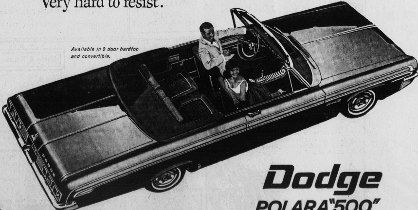
Available in 2 door hardtop and convertible.

The Dodge Polara "500" is new and hot and looks it. Smart, exclusive exterior trim... spinner wheel covers... bucket seats... and more. Options include console mounted automatic or four-on-the-floor... leather grained vinyl roof on hardtop. Worth having a look at. Worth having a drive in. Very hard to resist.