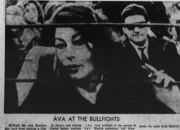
AVA AT THE BULLFIGHTS Bullfight fan Ava Gardner, in Mexico and visiting the first bullfight of the season in United States, watches the Madrid yesterday.

Shop Fri. to 9 p.m. Saturday to 4.30 p.m.