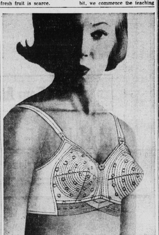
Exquisite Form's COMFORT ZONE BRAS - lets you take a deep breath