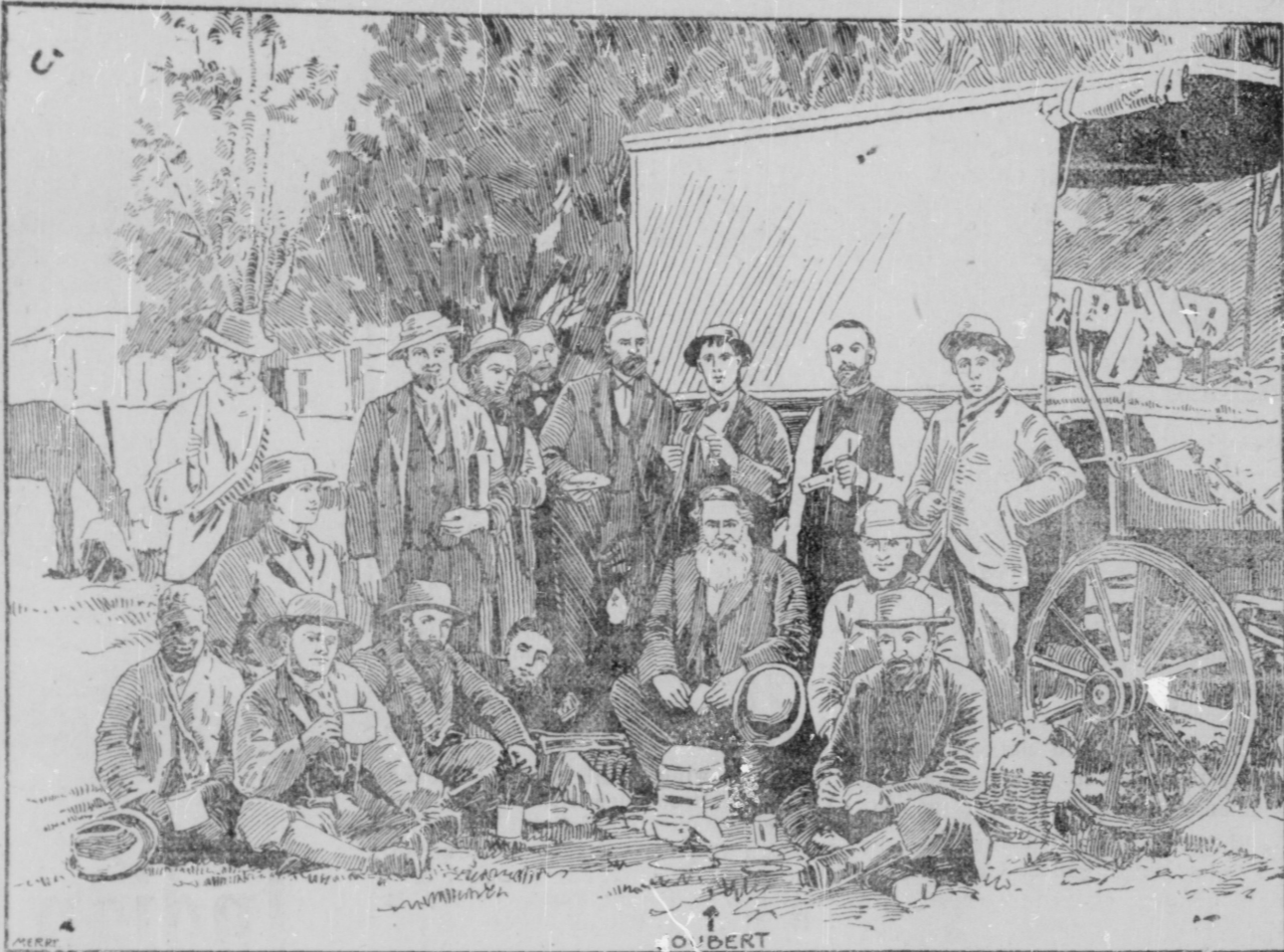
THE LATE GENERAL JOUBERT AND HIS STAFF BREAKFASTING ON THE FIELD.

See and try, all druggists, SCOTT & BOWNE, Chemists, Toronto.