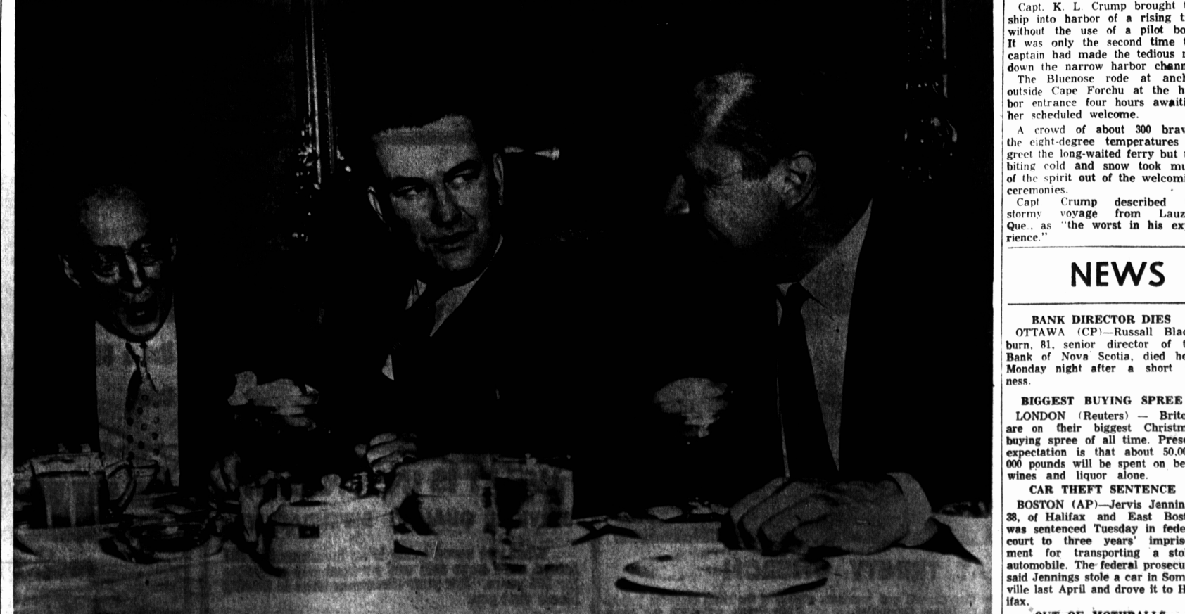
PRINCE EDWARD ISLAND M.P. AT WASHINGTON LUNCHEON