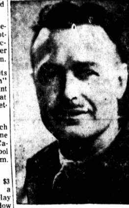
BRIG. G.G.K. PEAKE

The tender of Bevan Bros. respecting the supplying and installing of a new heating unit for City Hall, was accepted by the City Council at an emergency session last evening. The amount of the successful tender was $2,863, covering the supplying and installing of 1 Royoil unit of 4,800 sq. ft. capacity, with burner, electric controls, etc. The resolution adopted by the Council also authorized an allowance between Express and Freight charges, to bring the unit in, because of urgency of the time factor. It also instructed the City recorder to draw up a formal tender acceptance agreement, between Bevan Bros. and the City. Other tenders submitted included Douglas Bros. and Jones Ltd., two, $4,235 and $4,350; and Wilson and Moore, one, $3,951. All members of the Council were present with the exception of Mayor or Stewart. In his absence Deputy Mayor Walthen Gaudet presided. It is understood that the new unit would be shipped from Montreal last night or early today, and should therefore arrive in the city without delay.