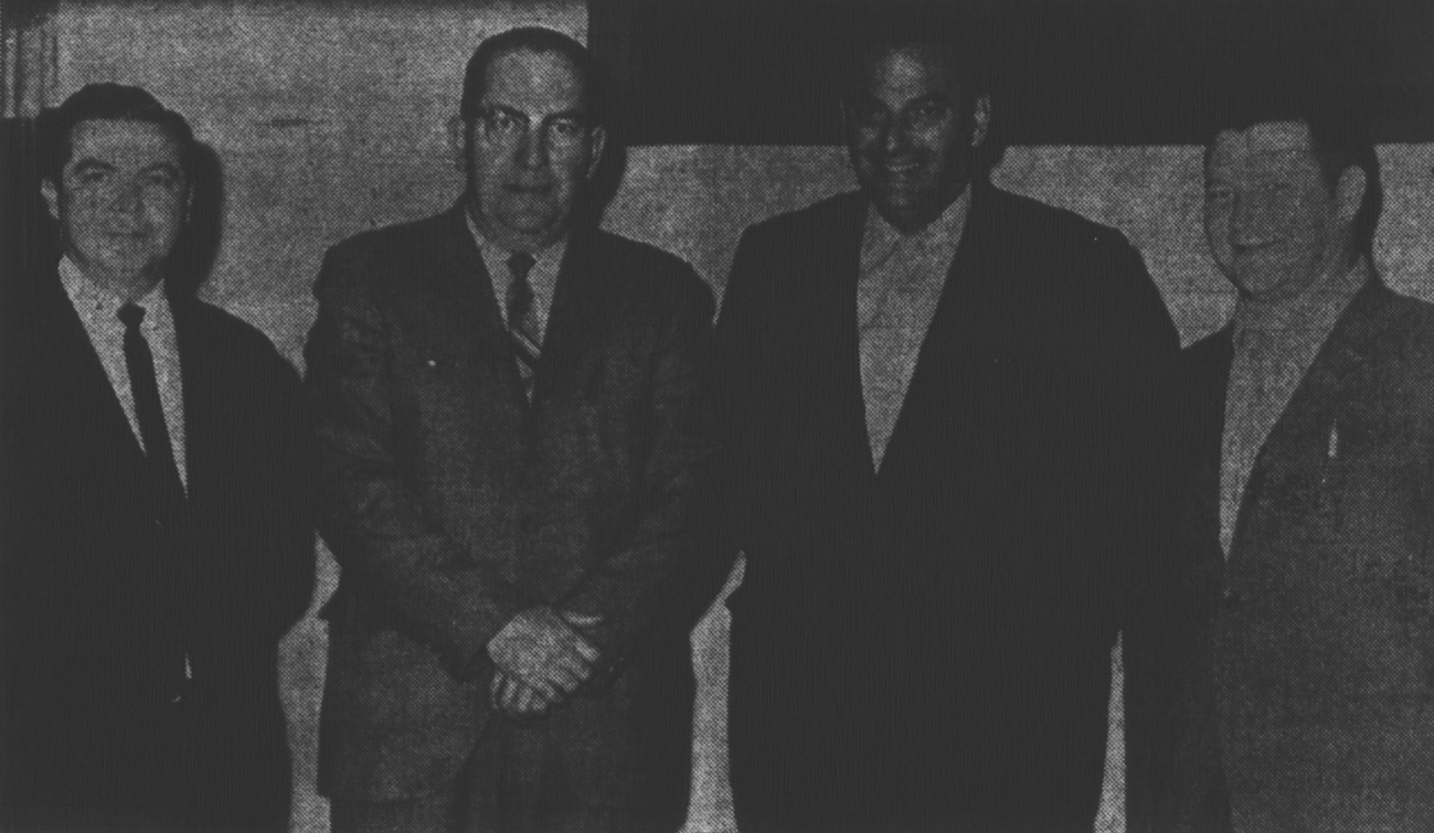
WITH PRIDE IN MARITIME HORSES

MAP UNSEEN MOON Soviet photographs of the other side of the moon now leave only five per cent of the planet unmapped.